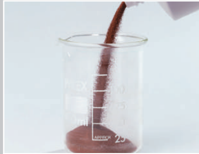
Easy to measure